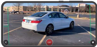
Image guidelines help during your vehicle walk-around to frame and capture the best media possible.

The SnapLot app guides you through capturing consistent, high-quality vehicle media using your personal device: